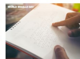
WORLD BRAILLE DAY

13 Lauri Maghi , an annual festival celebrated by the Sikhs commemorating the memory of 40 Sikh martyrs.